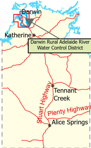
LOCATION MAP Not to scale