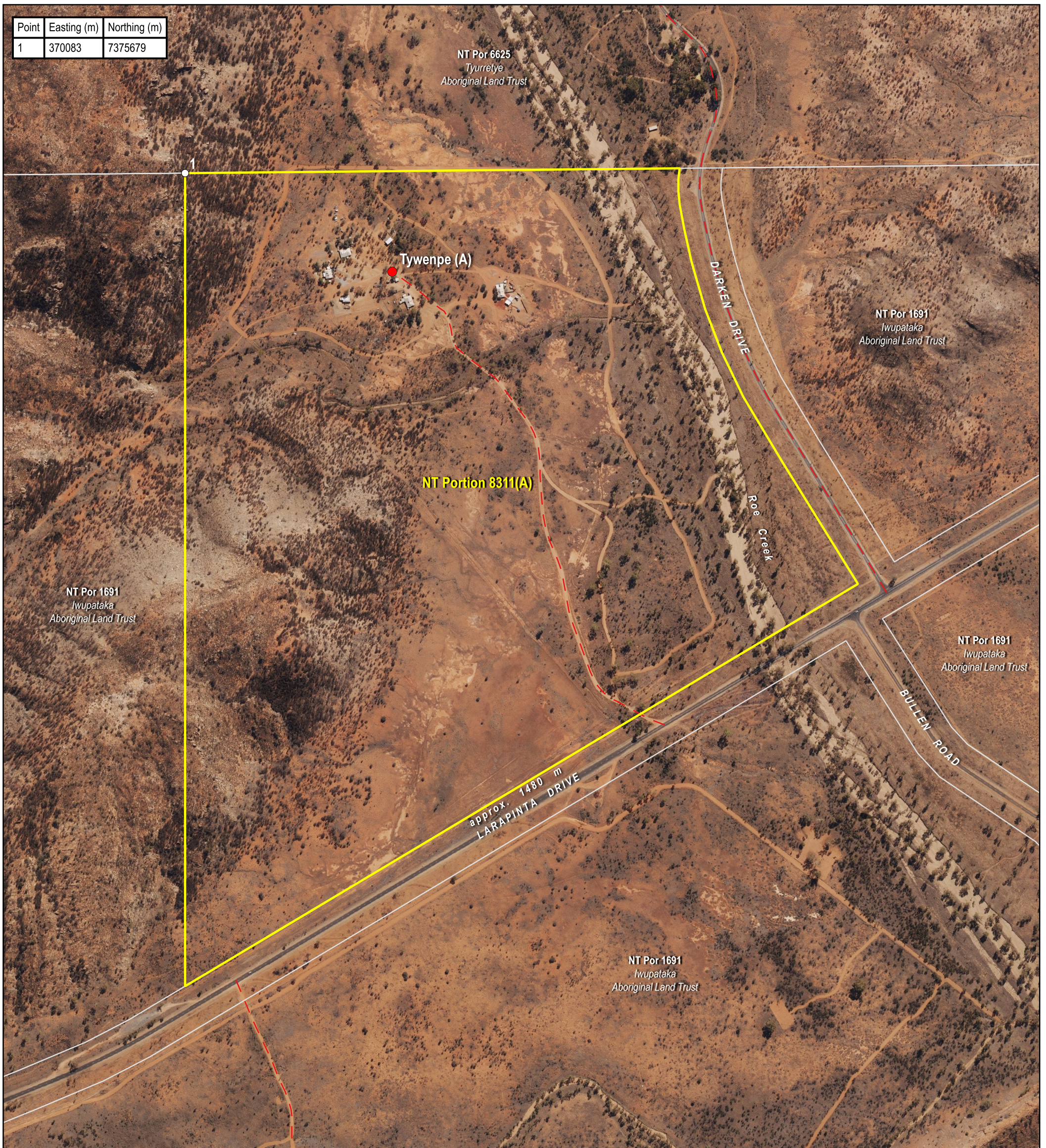
Locality Diagram (Not to Scale)