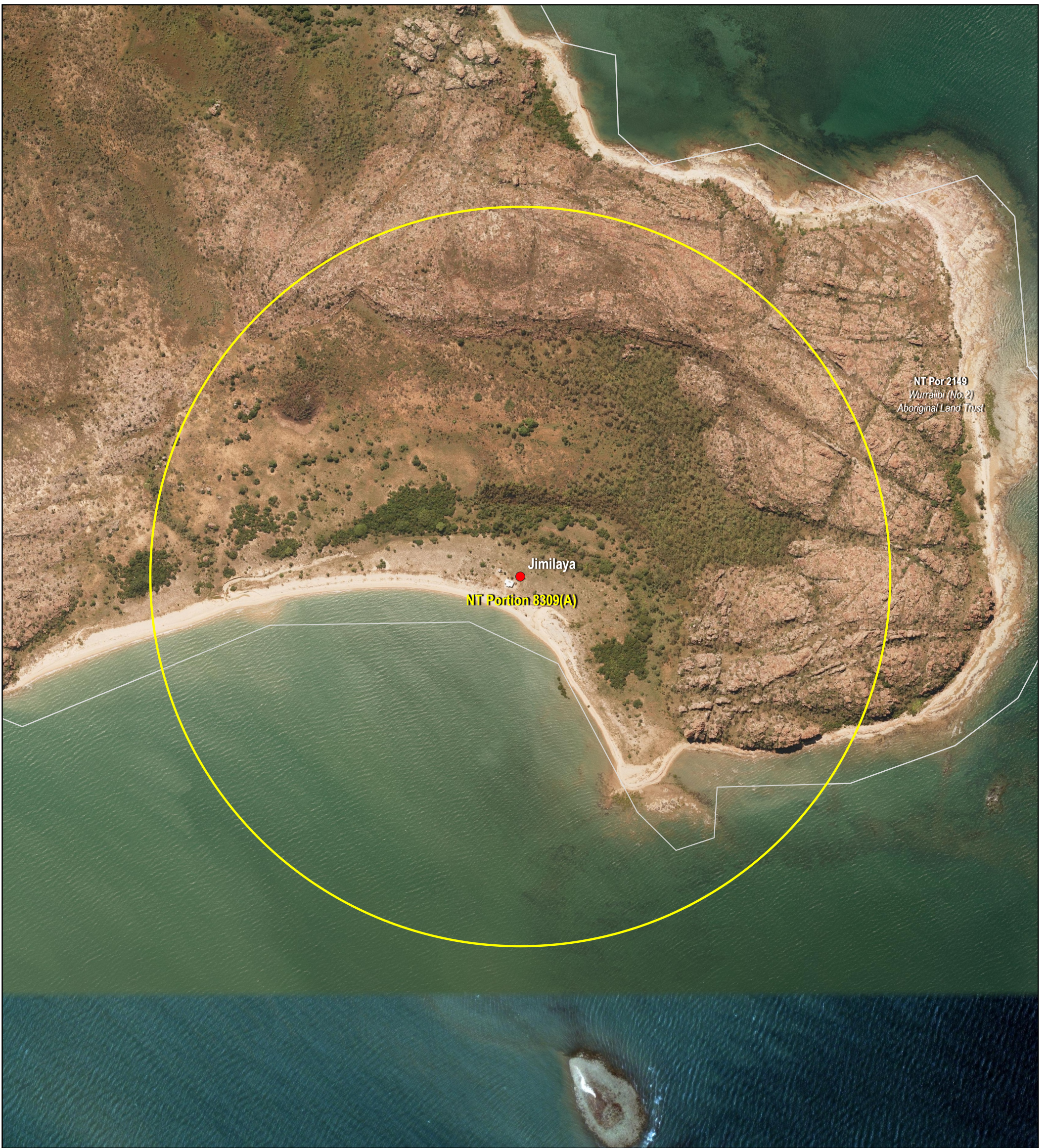
Locality Diagram (Not to Scale)