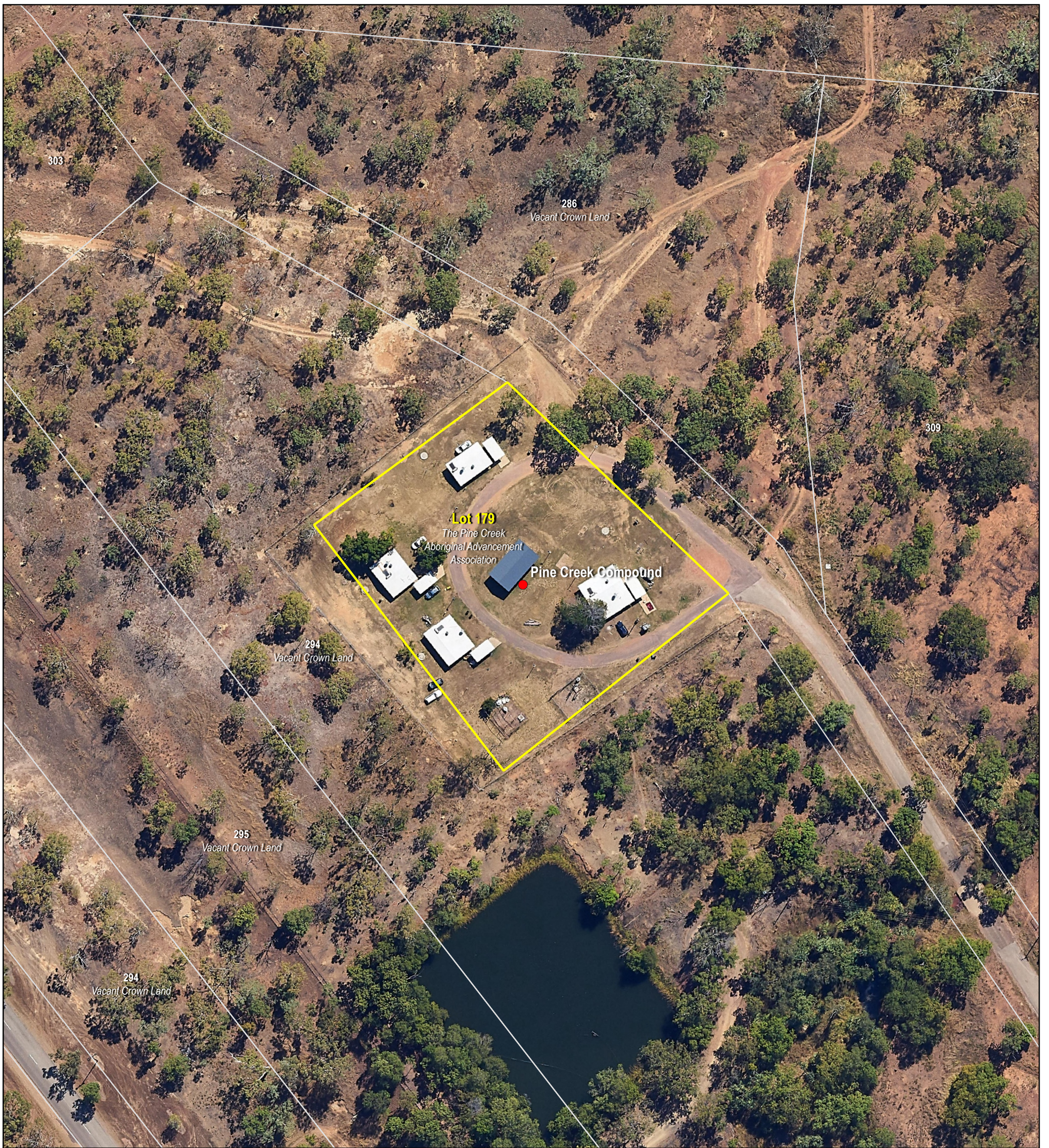
Locality Diagram (Not to Scale)