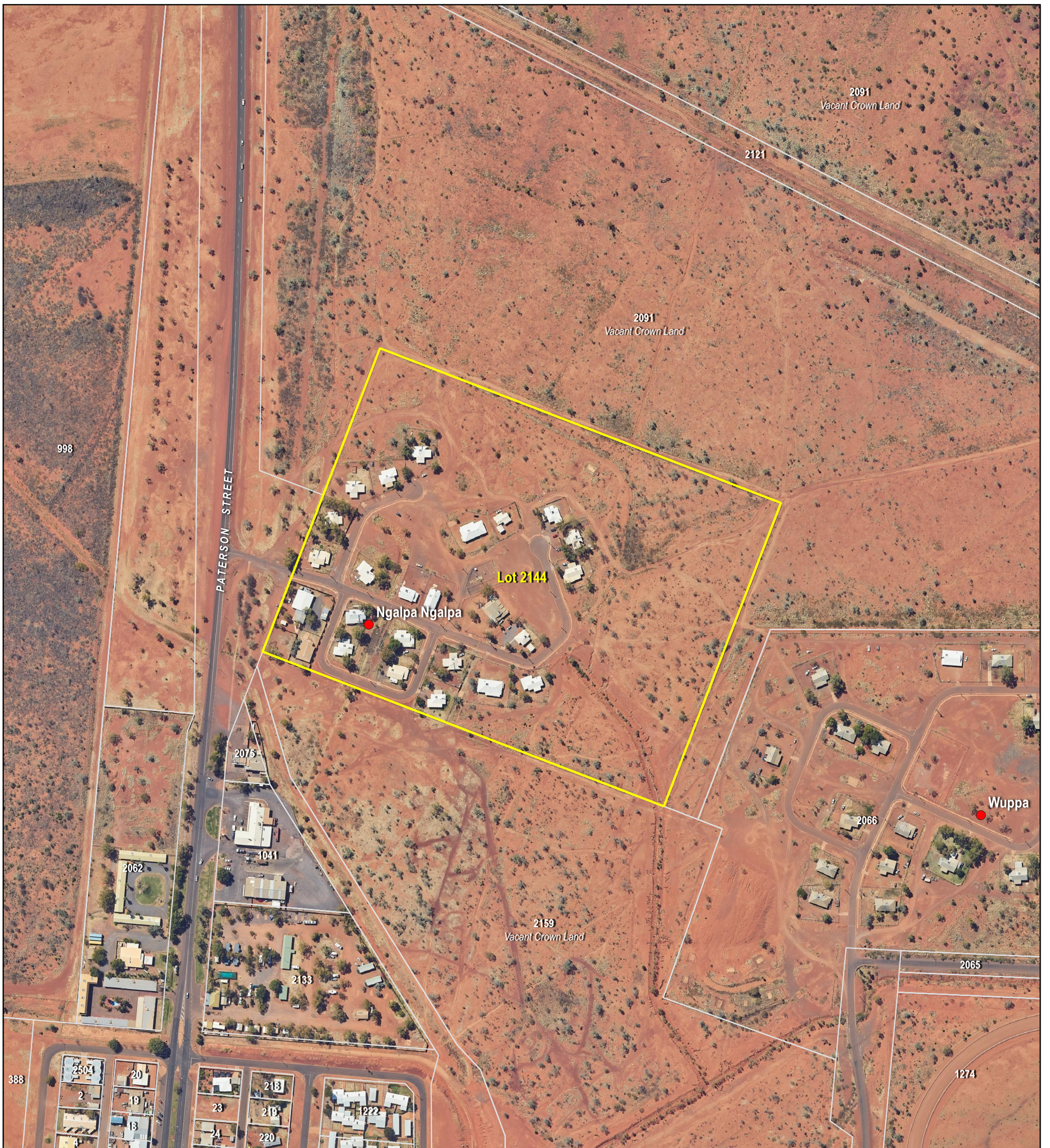
Locality Diagram (Not to Scale)