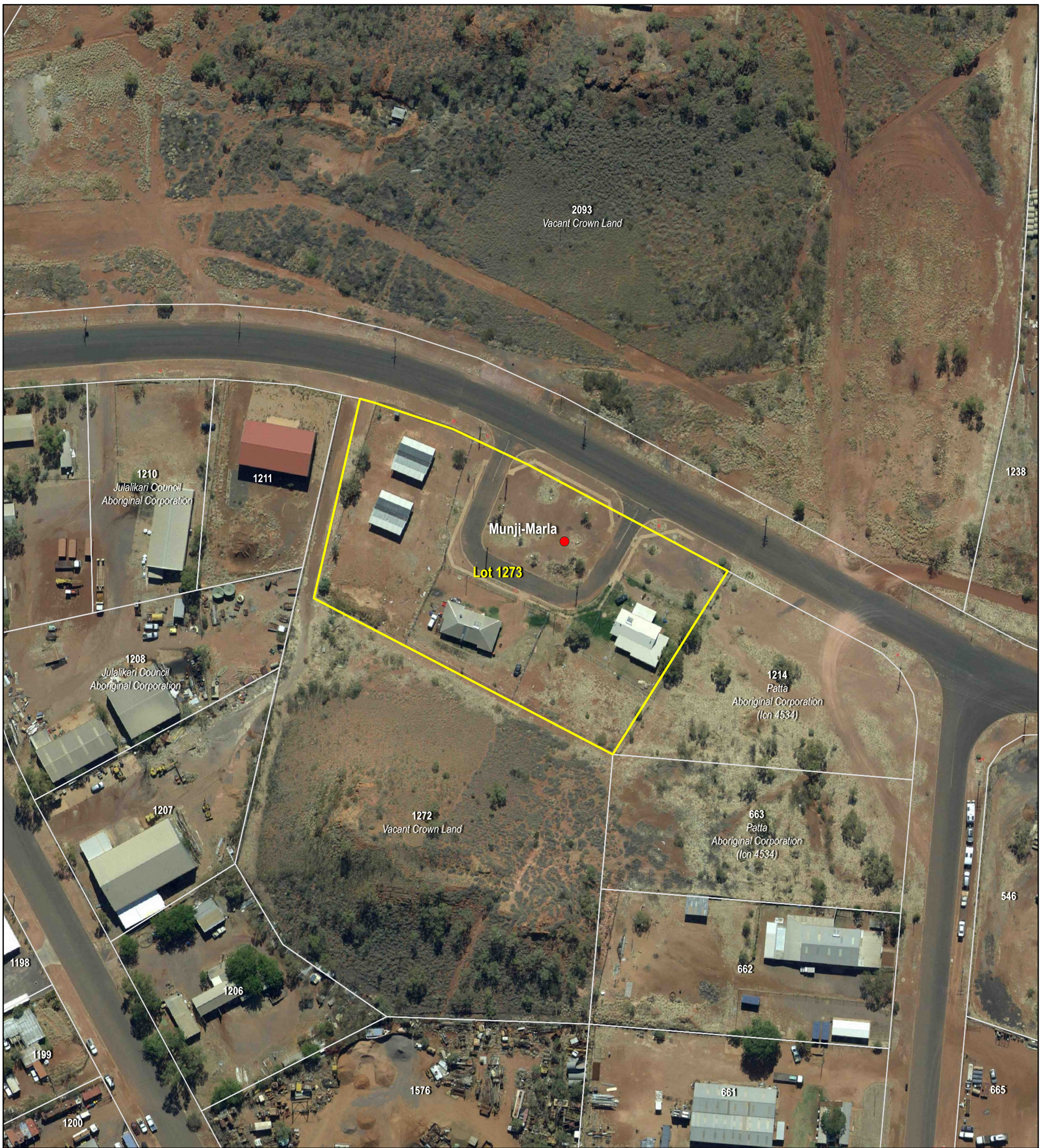
Locality Diagram (Not to Scale)