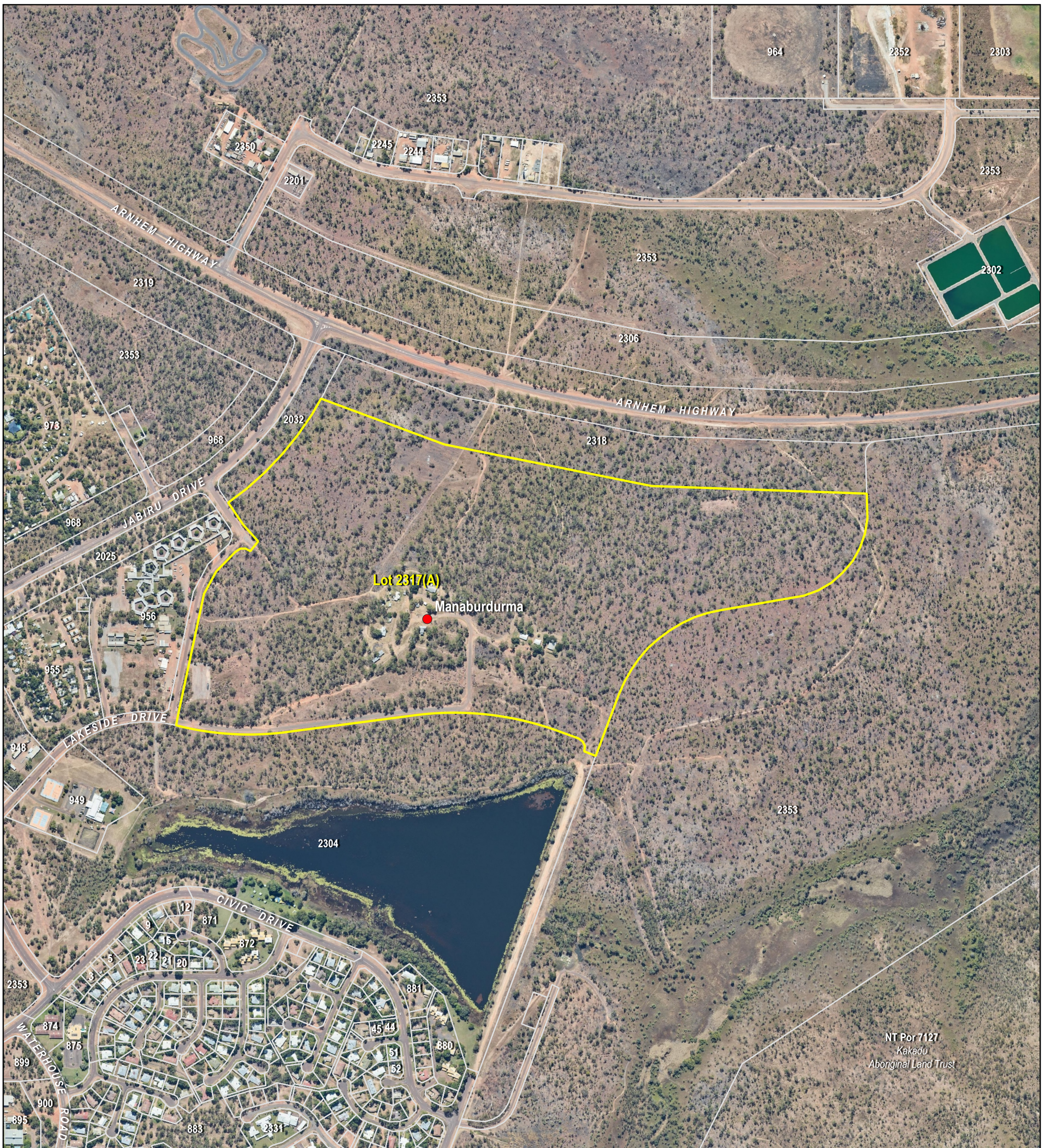
Locality Diagram (Not to Scale)