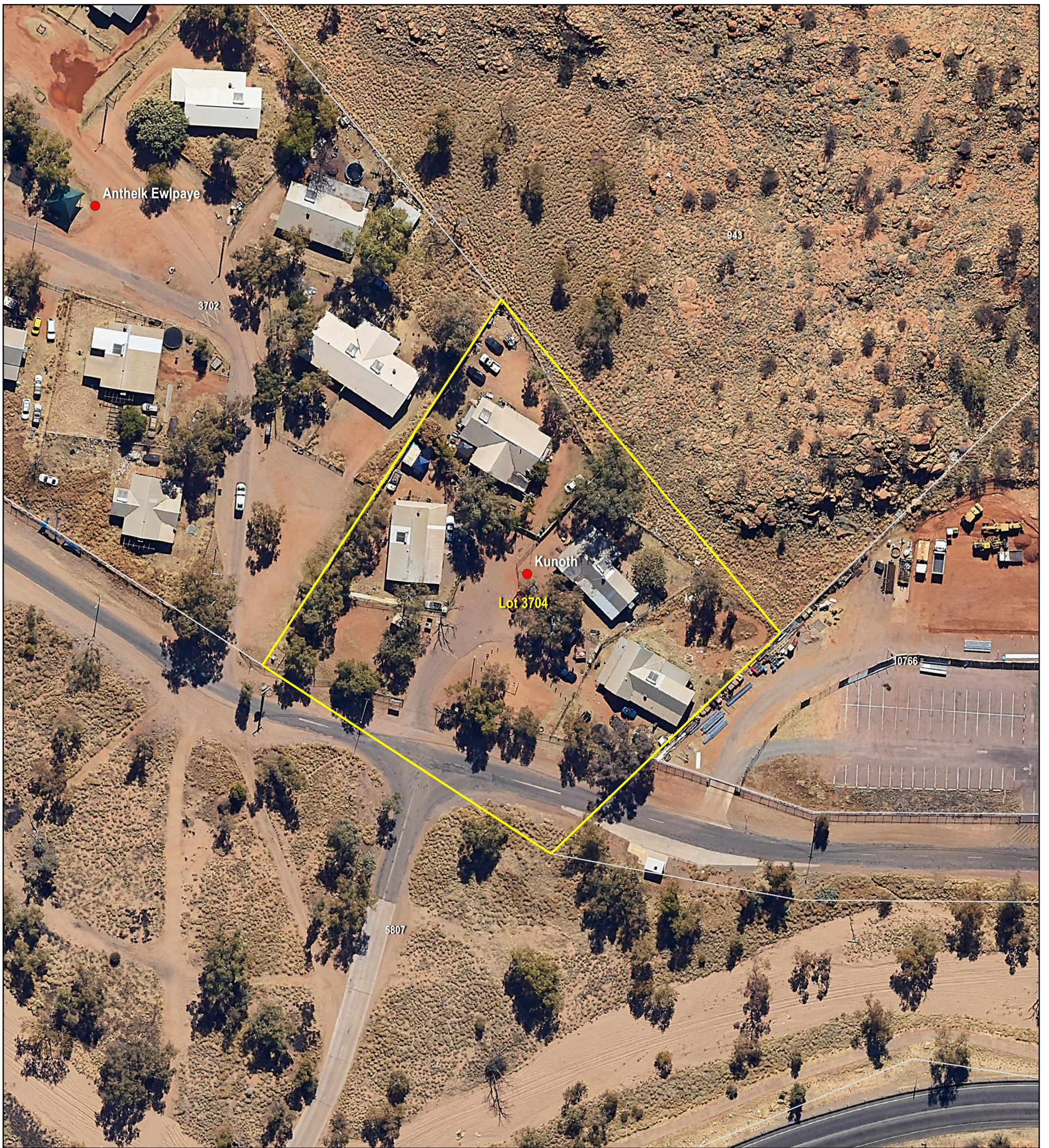
Locality Diagram (Not to Scale)