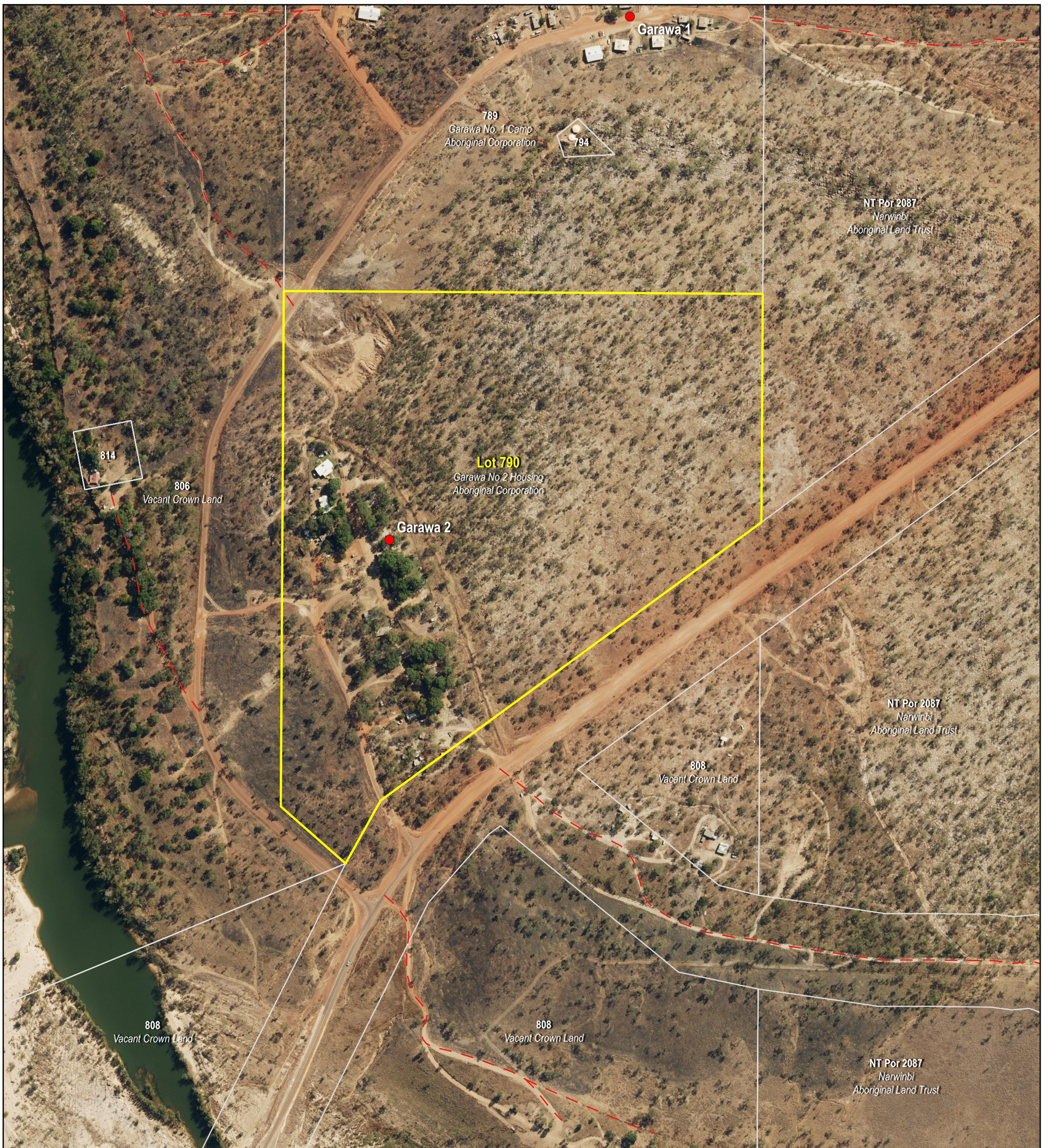
Locality Diagram (Not to Scale)