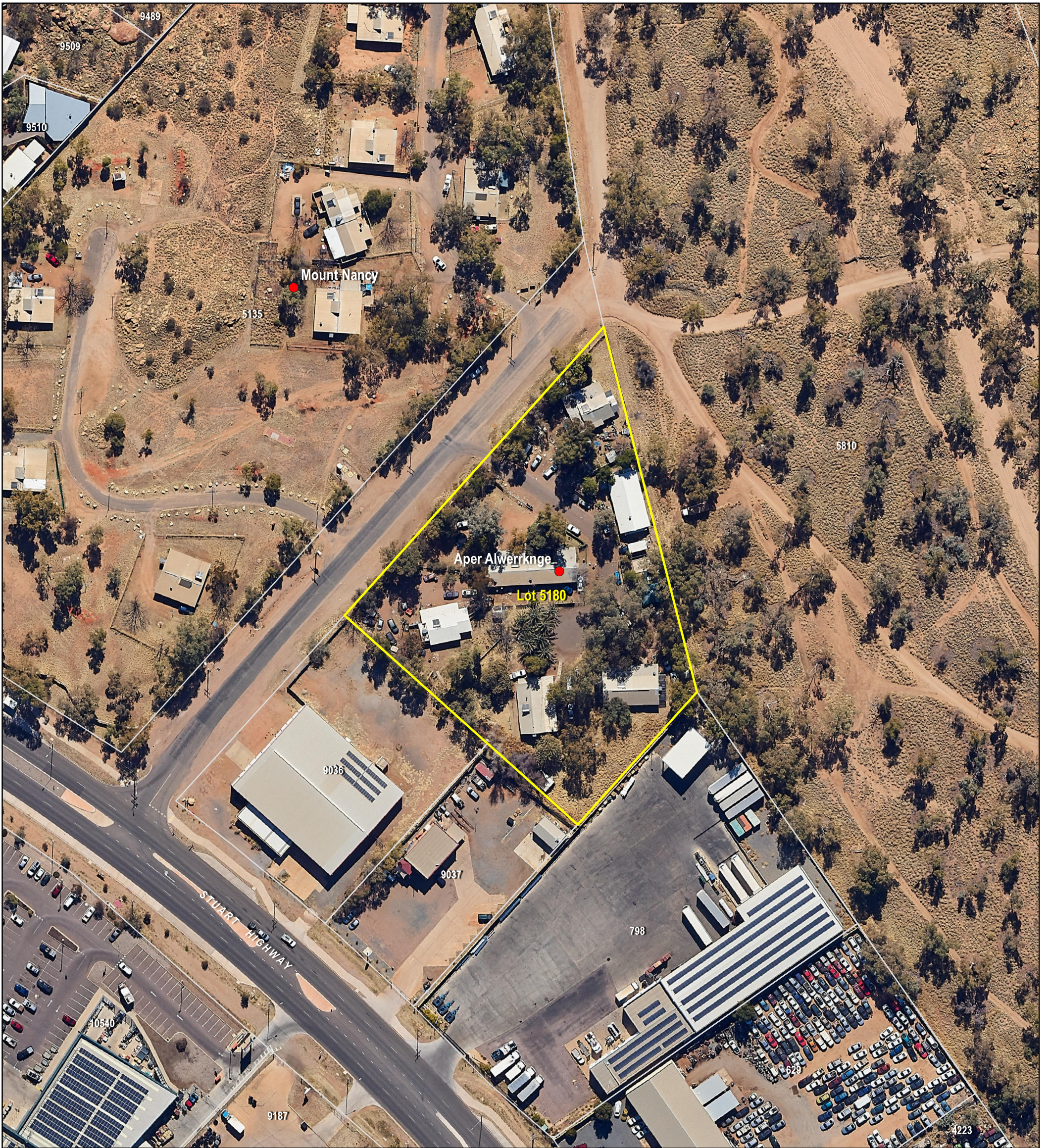
Locality Diagram (Not to Scale)