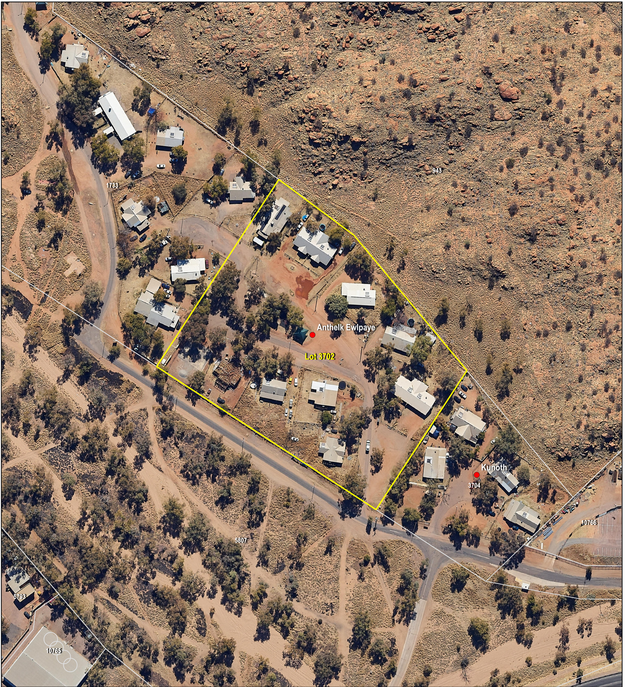
Locality Diagram (Not to Scale)