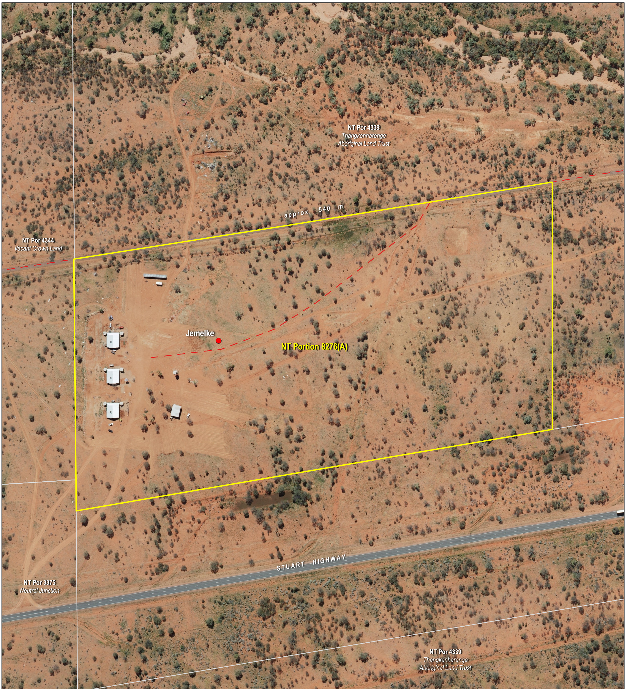
Locality Diagram (Not to Scale)