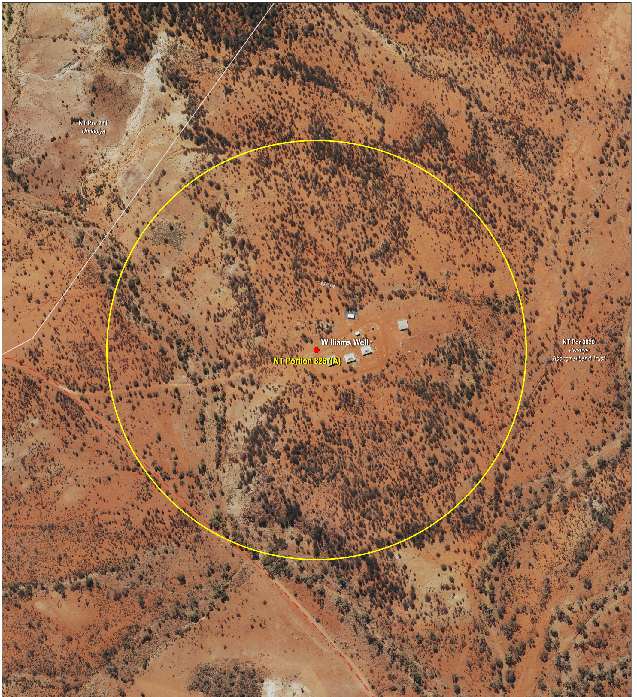
Locality Diagram (Not to Scale)