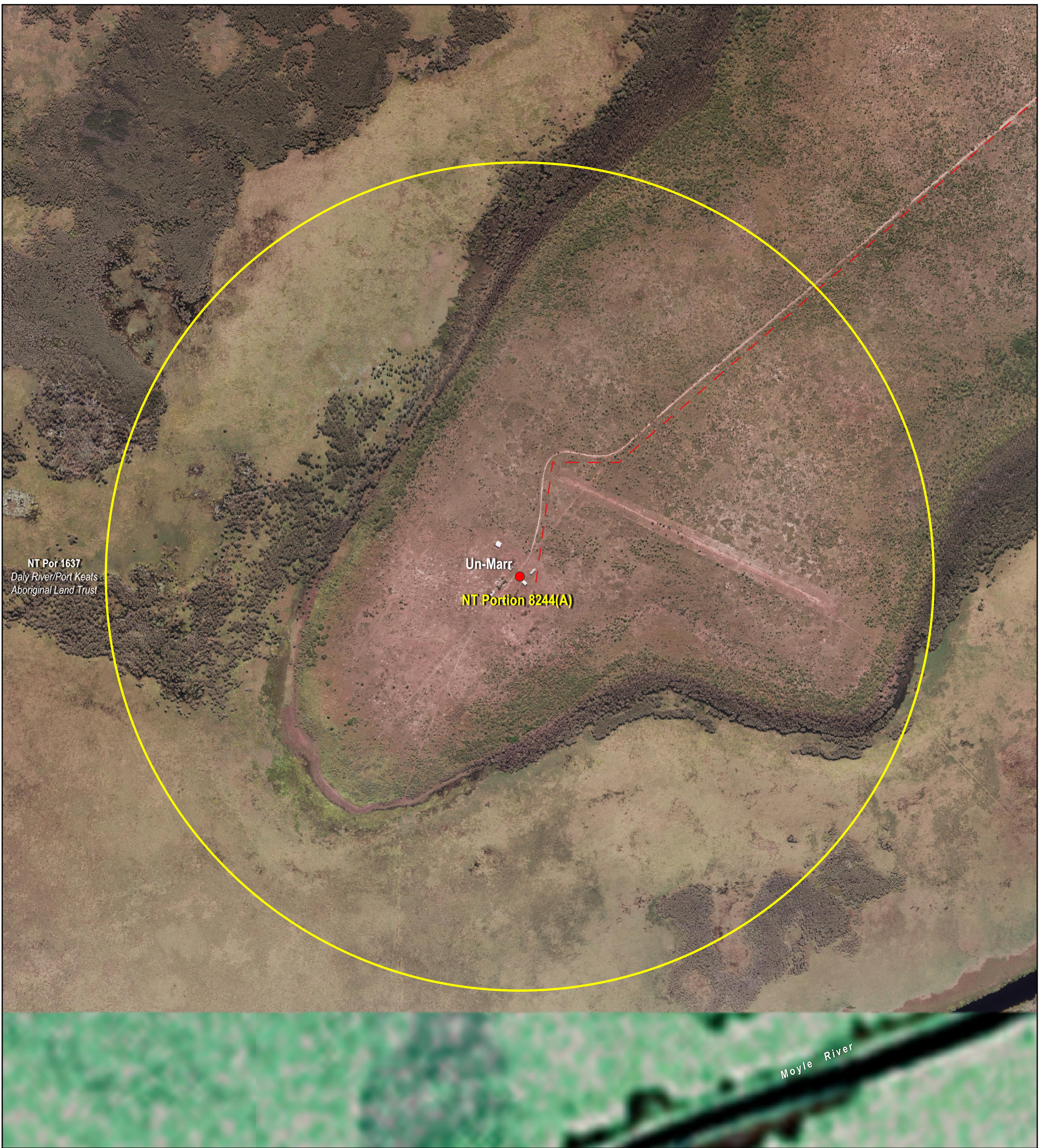
Locality Diagram (Not to Scale)