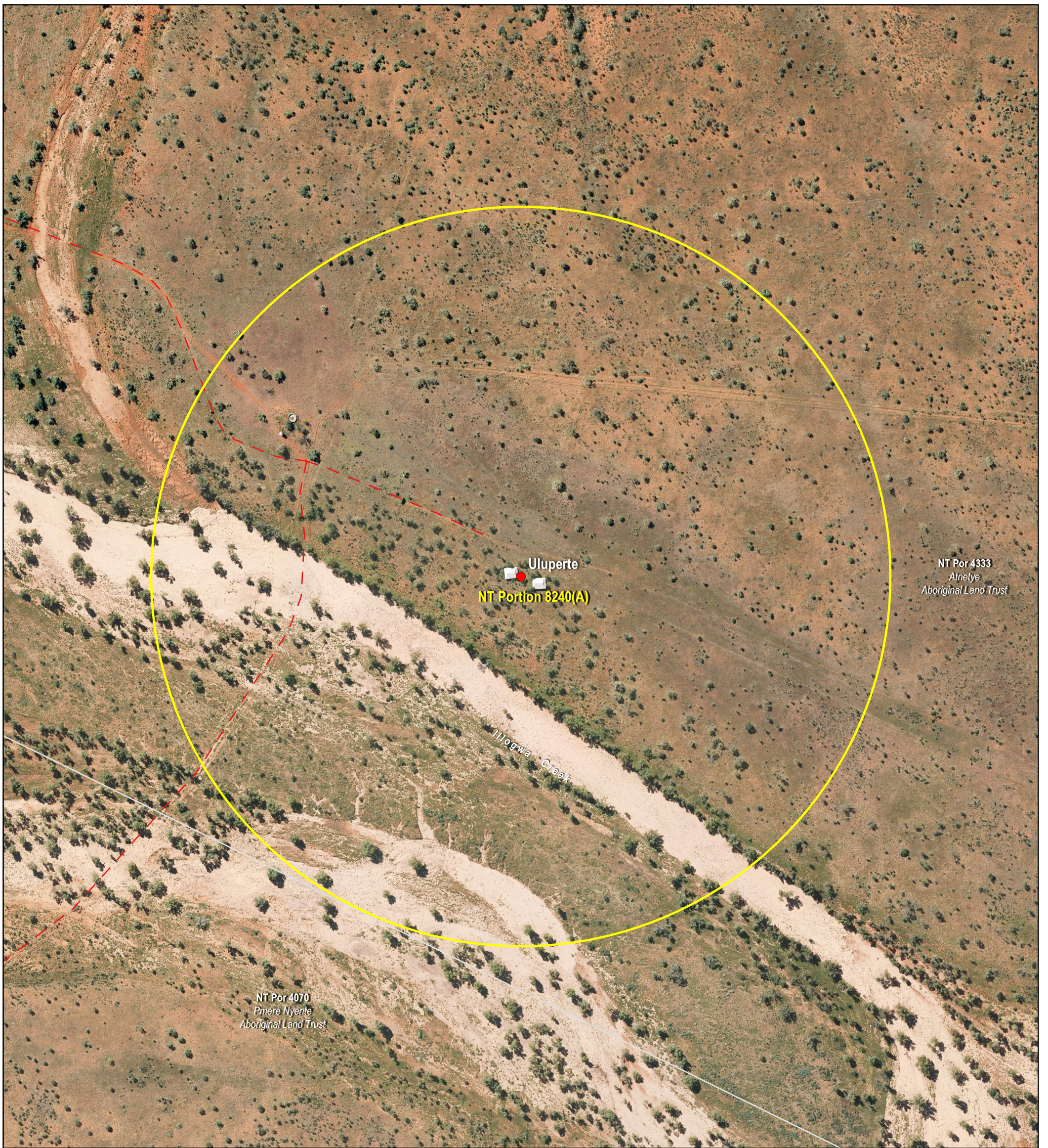
Locality Diagram (Not to Scale)