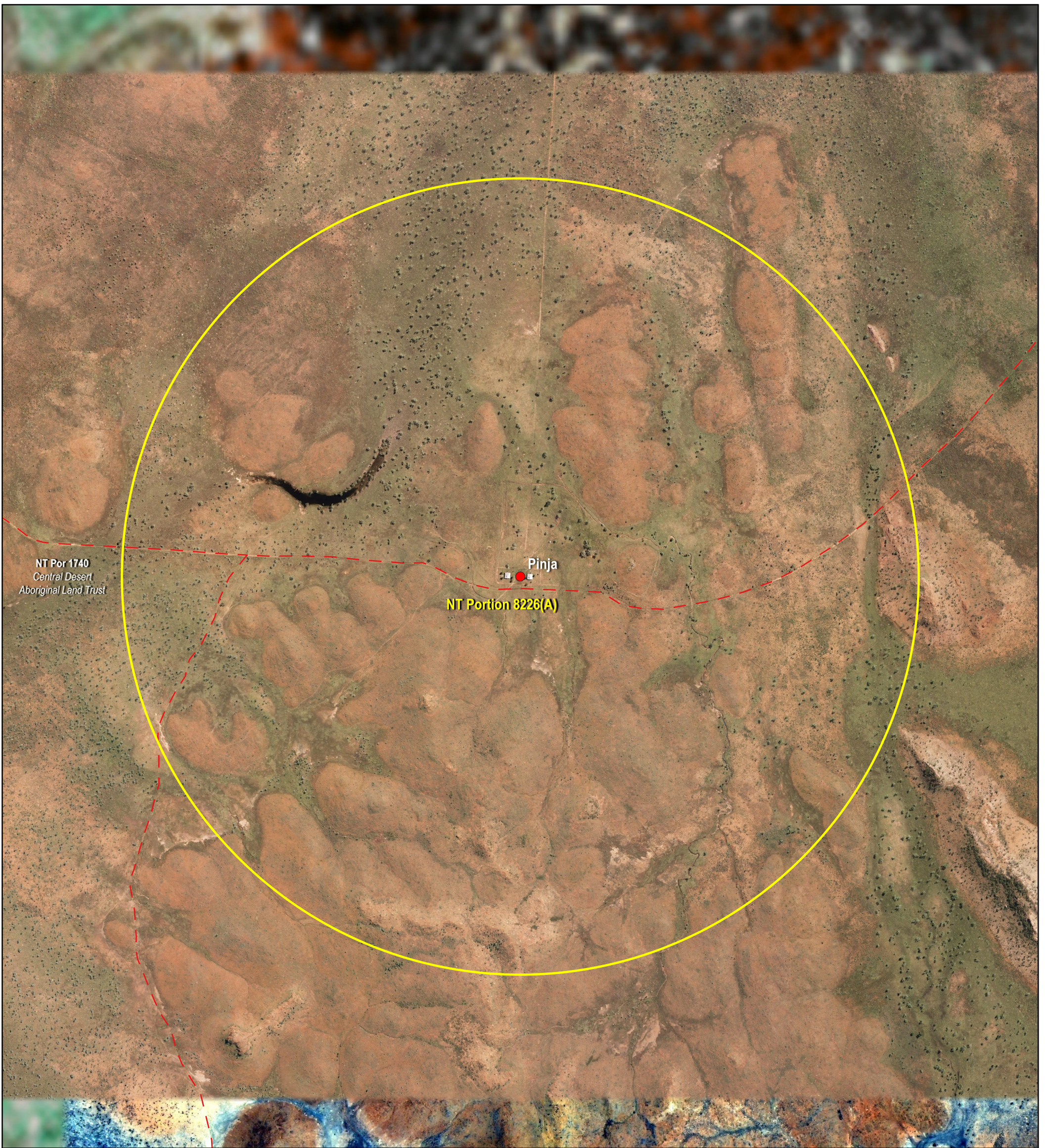
Locality Diagram (Not to Scale)