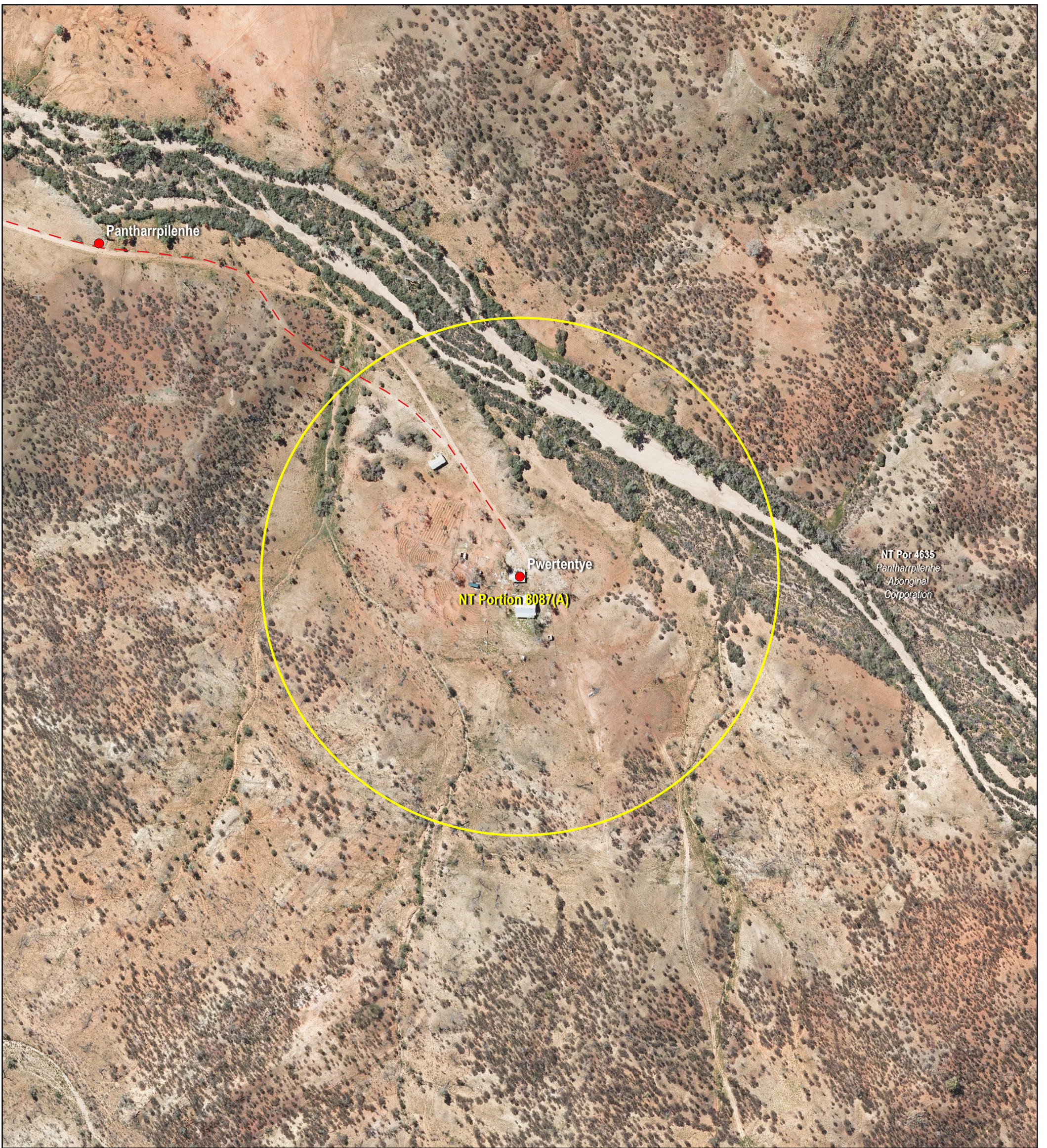
Locality Diagram (Not to Scale)