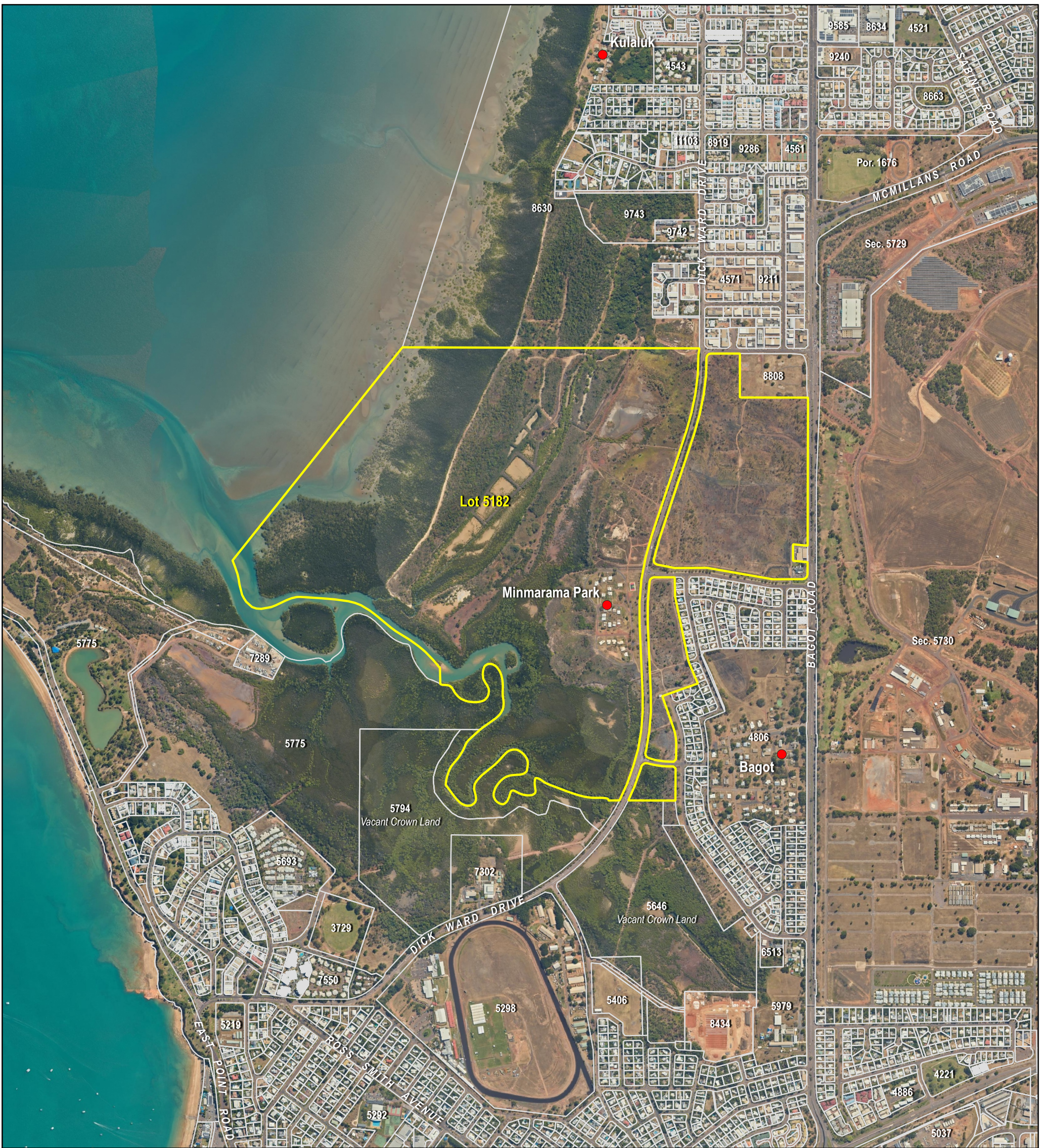
Locality Diagram (Not to Scale)